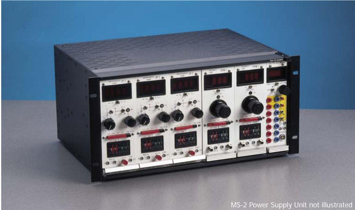
MS-2 Power Supply Unit not illustrated