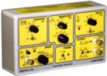
DG2A - A simple trigger source for our range of stimulators

The DG2A Trigger Generator is a compact, free-standing, battery powered device which can be used to generate trigger pulses necessary for repetitive stimulation. Also featuring DELAY controls, it can be used for determining nerve or axonal Effective Refractory Period (ERP) through the production of a delayed second pulse.