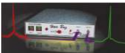
Quest Scientific HumBug Noise Eliminator

A remarkable device from Quest Scientific, the HumBug removes unwanted mains noise from an analogue signal without any of the "side effects" of filtering. The HumBug continuously monitors the mains noise and subtracts it from the signal in real time, without any waveform distortion, frequency loss, DC shift, signal attenuation or phase errors.