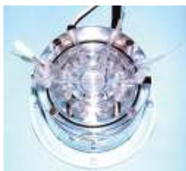
BSC1 Brain Slice Chamber

The BSC1 Brain Slice Chamber from Scientific Systems Design allows users to make electrophysiological recordings from brain slices in either the submerged or interface modes. A sloped insert was previously supplied with the BSC1 to reduce dead volume during interface recording, however, SSD have now withdrawn this accessory, and lowered the cost of the BSC1.