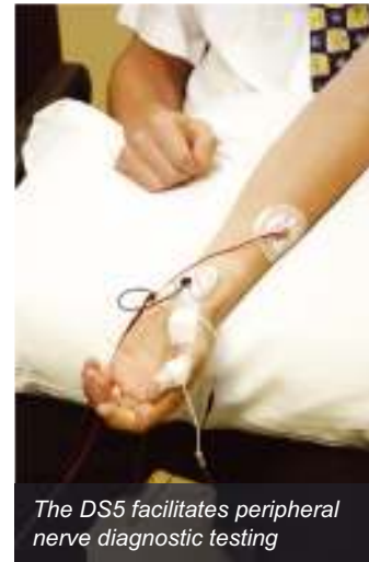
The DS5 facilitates peripheral nerve diagnostic testing

The DS5 has been developed in collaboration with Professor Hugh Bostock (Institute of Neurology, London) to facilitate "Threshold Tracking" studies of peripheral nerve excitability. Such tests are used routinely in research laboratories to study peripheral nerve physiology, but the lack of a suitable commercially available, medical grade stimulator has meant that they have not been adopted for standard diagnostic purposes.