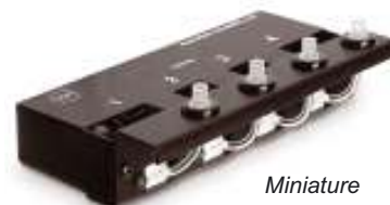
Miniature Lee Valves

Pinch Valves for Reduced Maintenance - Easiest valves to clean and switch tubing. Liquids never touch the valves. Switches in 30-50 ms. 1/32" i.d. silicone tube passes through, and is pinched closed by solenoid activation. All AutoMate Scientific valves include an individual indicator LED. The new aluminum enclosure keeps the valves dry from spills and offers luer lock ports for syringe reservoirs.