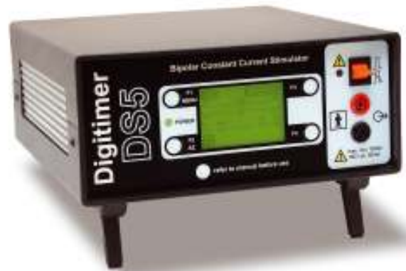
The Digitimer DS5 stimulator converts a voltage command waveform into an isolated constant current output

Although the DS5 has been primarily designed for clinical studies of peripheral nerves using threshold tracking techniques, we expect it to prove popular stimulator with any researchers wanting to apply a computer controlled, isolated bipolar constant current stimulus of up to \pm 50\text{mA} to a patient or research volunteer.