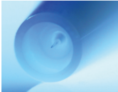
Close-up of a flyion "Flip Tip"

flyion GmbH have developed a system for obtaining automatic and reliable whole cell recordings from ion channels expressed in mammalian cells. Using "Flip the Tip" technology, a specially fabricated glass microelectrode is filled with a cell suspension and giga-ohm seals are made between a cell flushed towards the tip. By applying suction from the outside of the tip, a stable whole cell recording can be achieved with extremely low access resistance (approx. 3Mohm). Alternatively, the system is also capable of making perforated patch recordings. Through Digitimer, flyion currently offer the Flyscreen 8500 Patch Clamp Robot , the more compact PatchBox and a Feedback Microforge for the production of specially shaped pipettes.