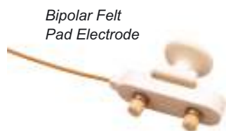
Bipolar Felt Pad Electrode

If you are looking for a particular type or size of electrode that we don't yet stock, just let us know and we will see if we can source it for you.