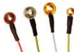
EEG Cup Electrodes