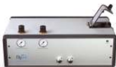
Feedback Microforge - for manufacture of custom electrode shapes

Please contact Digitimer for full details on the full range of patch-clamp hardware and software available from flyion and HEKA, as well as data acquisition hardware and software products from InstruTECH and Bruxton Scientific.