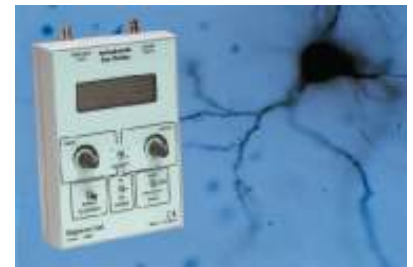
D380 Dye Marker - Dye Injection of cells for neuroanatomical visualisation

The D380 Iontophoretic Marker provides a compact and easy to use solution for dye labelling of cells or injection of pharmacological agents. Electrophysiologists often use an existing patch clamp amplifier to provide current to carry out such tasks, however, if these techniques are not already being used in the laboratory, alternative iontophoretic devices are often prohibitively expensive. The D380 provides a cost effective answer, delivering currents of up to \pm 12\text{nA} , with a holding current of up to \pm 6\text{nA} . A deblock button provides a means of removing blockages from the end of electrodes and an LCD display allows continuous monitoring of several parameters.