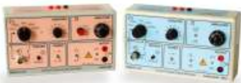
Our Compact, Low Noise DS2A & DS3 Stimulators

The Digitimer DS2A (constant voltage) and DS3 (constant current) Isolated Stimulators are popular in electrophysiology laboratories all over the world. Their compact and user friendly design has generated a loyal following amongst researchers wishing to precisely stimulate nerve or muscle from an isolated power source.