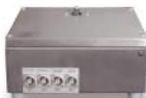
flyion PatchBox - compact desktop patch clamp solution