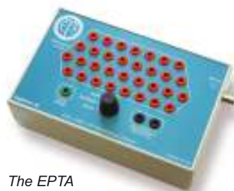
The EPTA Performance Checker is now manufactured by Digitimer

The EPTA (Electro-Physiological Technicians Association) have transferred the manufacture of their model 1179 Performance Checker to Digitimer Ltd. As a result, we are now able to offer the updated 1179A unit (model D179) with or without the required function generator (see below).