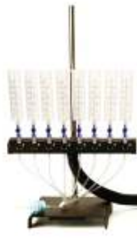
AutoMate Scientific ValveBank Perfusion System

Enhancing their position as a leading manufacturer of perfusion systems, AutoMate Scientific now offer complete systems based around Lee Mini Valves, in order to enhance liquid switching times. Here we take a look at the three types of valve now on offer:-