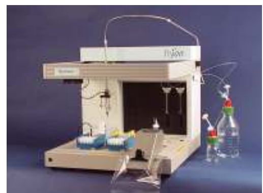
The Flyscreen 8500 Patch Clamp Robot - available in three or six channel versions