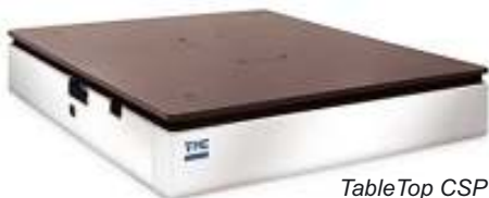
TableTop CSP Antivibration Solution

It isn't always convenient or necessary to build a rig around a standard anti-vibration table, so the engineers at TMC have developed a novel solution. TMC now offer the 66 Series TableTop Compact Sub-Hertz Pendulum (CSP) High Performance Vibration Isolation System. This compact (18" x 20" x 3") platform can be placed on a bench top and after connection to a gas or air supply is ready to use. At 22kg it is also easy to transport for relocation purposes and