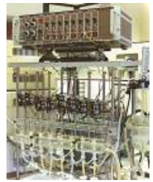
D330 MultiStim System

The D330 MultiStim System is a modular and versatile multi-channel stimulator for biomedical scientists requiring accurate in vitro stimulation of multiple low impedance tissue preparations with different stimulating voltages or currents. Timing modules are available to generate pulses, variable in frequency and duration, which can be controlled as trains using a gating waveform, variable in repetition rate and duration or pulse count. Sockets are fitted to allow full external control and synchronisation if required. The D330 MultiStim System comes as a 19" rack-mountable unit that can house up to ten stimulation channels - along with the pulse train generator, gating and meter modules. In order to help with module selection, a number of application diagrams are downloadable from the Support section of our website.