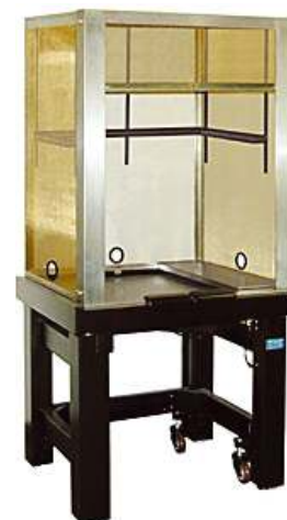
TMC Antivibration Table and Faraday Cage

Standard tables are available in sizes from 25" x 36" to 36" x 60" with stainless steel laminate, plastic laminate or drilled top plates designed to suit your particular applications. The variety of optional accessories includes casters, arm rests and sliding shelves. Changes to the design of the Type II Faraday cages include the provision of an optional hanging shelf, rubber lined holes for cable passage in and out of the screened environment and a "roller blind style" front panel which is more convenient to operate than hinged doors.